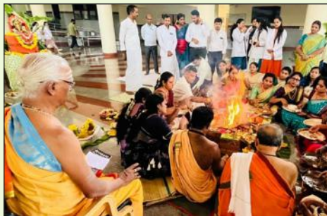
Dhanvantari Pooja and Shishya Upanayana Ceremony