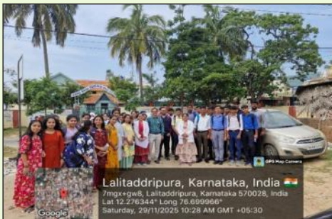
Full day rural community outreach programme –Jeevaneeyam