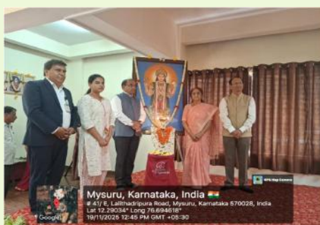
Inaguration of Pragathi 2025 by dignitaries