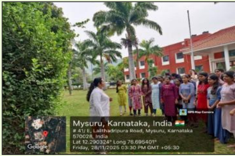
Field visit to garden