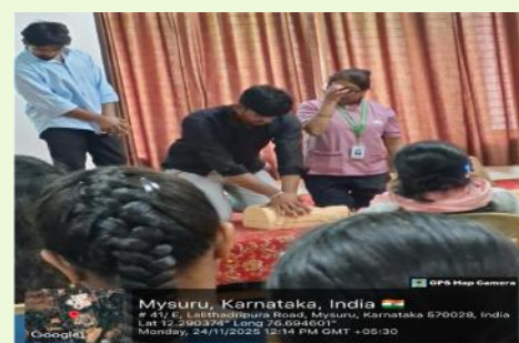
Basic life science training session