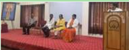
Anatomy workshop (Bridge course) for Physiotherapy Post Graduate Students was organised and conducted by department of Rechana Shareera (Anatomy) on 30th and 31st January 2023.