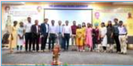
Our College 12 U.G. Students participated in a Paper presentation at "SIDDARASADYUTI-2023", A National