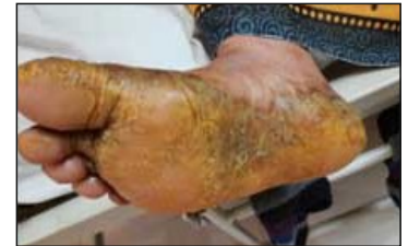
After treatment (First follow up)